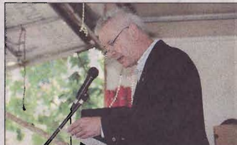
Senator Doug Cameron